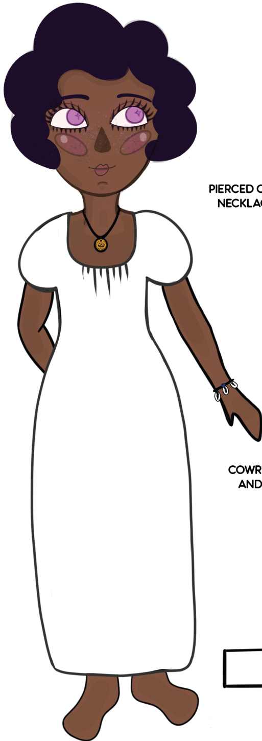
PIERCED COIN NECKLACE

PRINT THIS PAGE AND THEN COLOR, CUT, PASTE, AND DRESS THE PAPER DOLL.